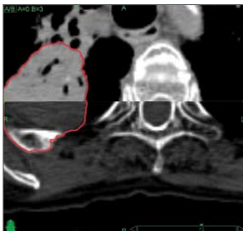
Aligning the target identified in each phase of the breathing cycle results in a target-centric beam's eye view. The split view shows that the target (red contour) is aligned and shows the deformation of other anatomy such as the spinal canal.