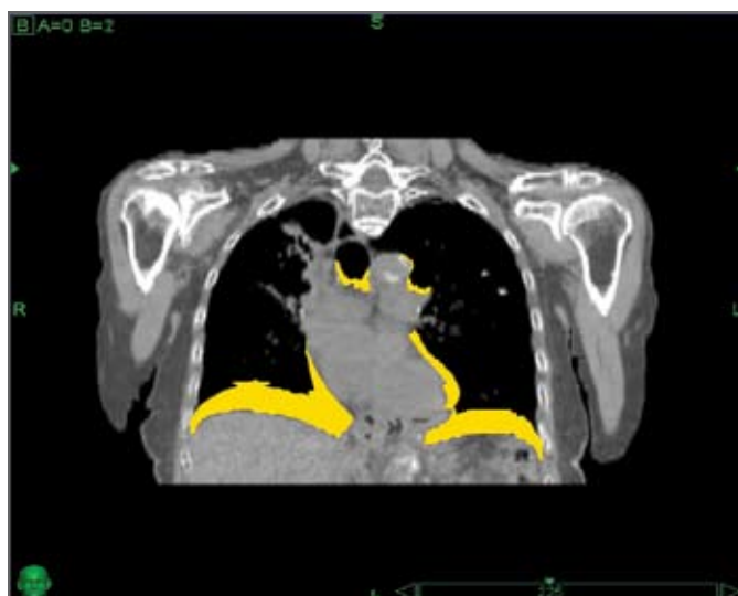
Changes in patient anatomy (highlighted area) can be seen by viewing the same 3DCT slice at different phases of the breathing cycle.

Rather than work around the uncertainties caused by respiration, the 4D Treatment Optimization and Planning System incorporates these uncertainties into the optimization and planning process. The resulting dose calculation considers the intra-fraction motion of not only the treatment target but all surrounding critical structures as well.